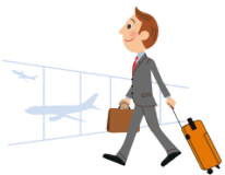
go on a business trip