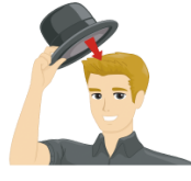
put on [a hat]