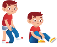
put on [shoes or trousers]