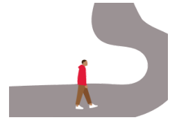
walk [along a road]