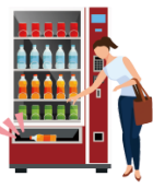
[juice] come out