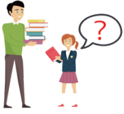
ask [the teacher]