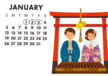
New year's day