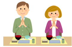
That was delicious.