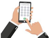
make (a phone call)