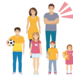
someone else's father