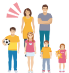
someone else's mother