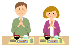
Thank you. (before eat/drink)